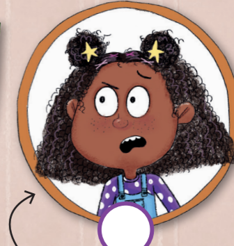
Worried and angry at the same time!

Maggie has made some things disappear! Can you spot what's missing?